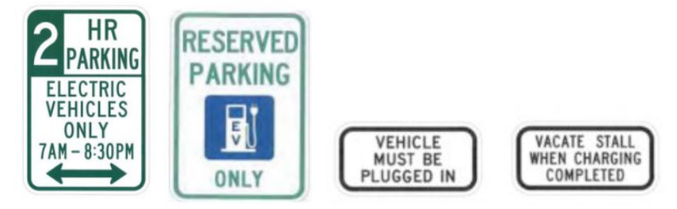
Figure 2: (Labeled Left to Right A-D) Example EVSE regulatory signs.

Regulatory signs should be no smaller than 12" x 18" and placed immediately adjacent to the EVSE at a height of 7 feet.